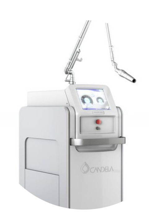
How the PicoWay Resolve Laser Works