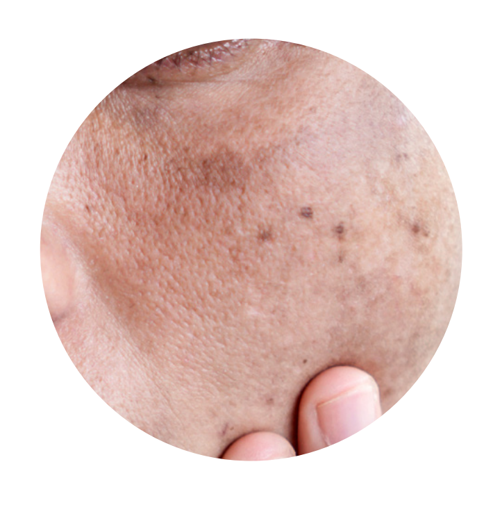
Benign Pigmented Lesions (Dark Spots)