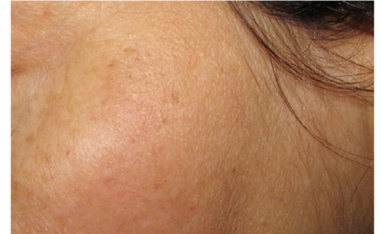
1.5 months after 2 PicoWay system treatments.